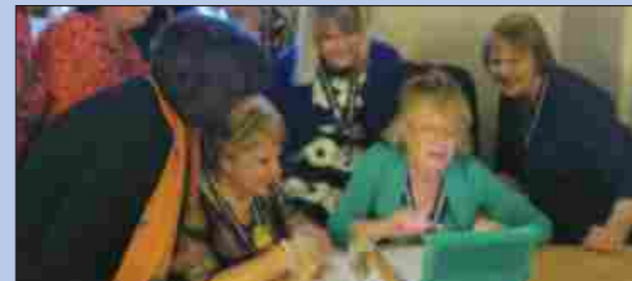
Editor's Note: Tangent Ukraine: A very modern Charter!

In the February magazine we reported that we were in talks with a lady in Ukraine about setting up a Tangent Club there and it has now happened with Tangent GB as their godmother. There was a major problem due to the war situation as we could not travel to Ukraine and they could not travel here so the Charter took place on Skype while the National Executive, a few other Tangent ladies and a couple of 41ers were all together in Londonderry for the Irish Lunch on 28 March. It was great fun, if a little difficult all gathered round an iPad, but we managed to "present" their charter certificate virtually over the internet. The main purpose of Tangent Ukraine is to raise money to support women and children affected by the war and we hope we can help them do that. They have started with just 6 members but hope to grow very quickly. As Ukraine has affiliated to Tangent GB they are entitled to become Associate members of TCI and that happened at the 1st TCI AGM in Cyprus on 24 April 2015.