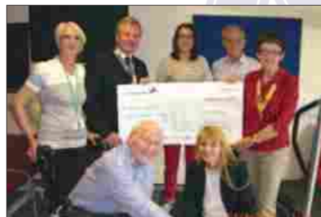
People in the attached photograph

Editor's Note: Congratulations Bedford Tangent and 41 Club! A fantastic sum for a wonderful Charity